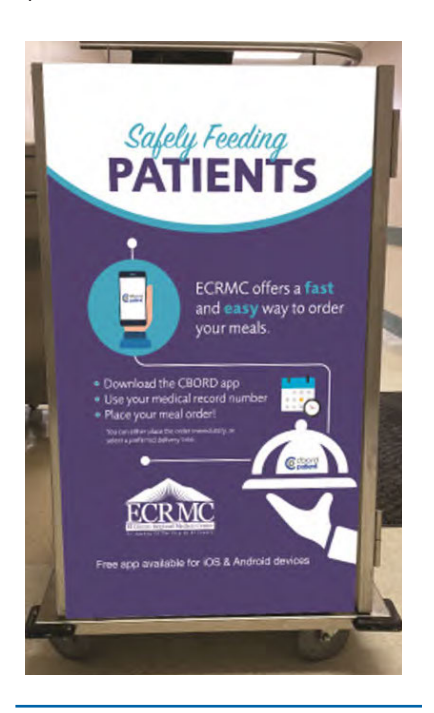
ECRMC markets the app throughout the hospital.

By giving patients and their families the power to choose their meals and delivery times—and letting them use a convenient, always available mobile app that displays a personalized, compliant menu—Walters is helping establish ECRMC as a leader in providing an outstanding experience for patients and their families.